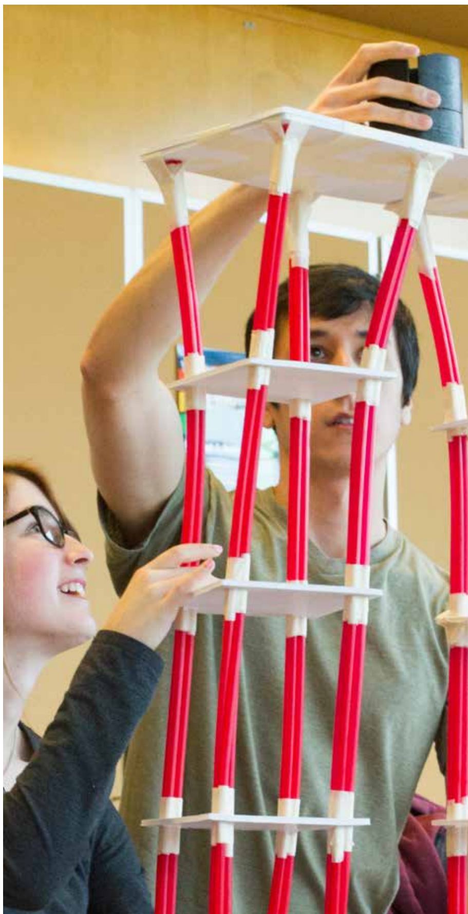
Engineering / Straw Tower Project ►

The diverse student body is one of Tacoma Community College's greatest strengths. Students of color comprise 41 percent of all TCC students. TCC also hosts nearly 400 international students each quarter, whose global perspectives enhance the TCC experience. Whether teenagers or members of the over-50 population, students are likely to find classmates like them in their TCC courses.