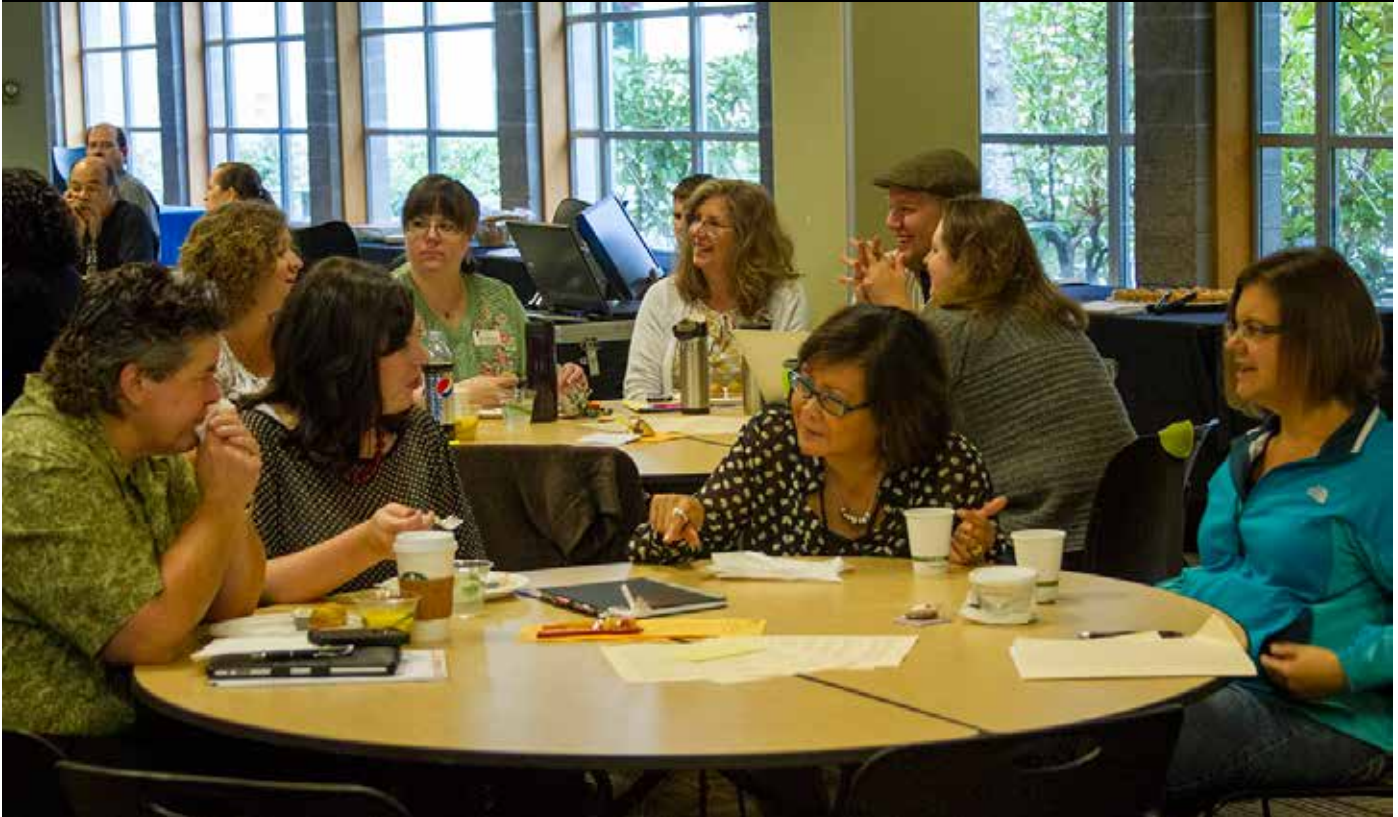
▲ Faculty and staff at Professional Development Day.