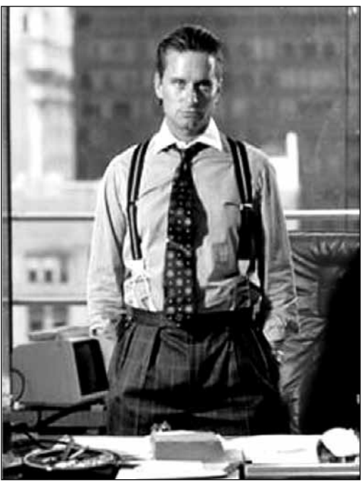
This is a picture of a "successful psychopath", Gordon Gekko from Wall Street 1987. Despite how he was a psychopath, he is not running rampant and killing people. Most people will not realize that there are psychopaths like him.

From that harsh negativity that the media brings about psychopaths come the myths. The first one is that all psychopaths are violent. This is definitely not true. "Not all psychopaths are murderers-and not all murderers are psychopaths. In fact, studies suggest that nearly one per cent of the general population fits the clinical definition of psychopath. But very few are criminals, let alone killers" (Friscolanti). This quote