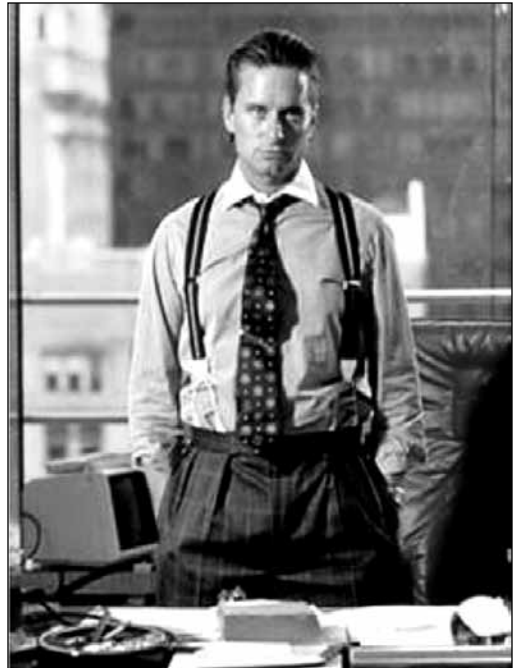
This is a picture of a "successful psychopath," Gordon Gekko from Wall Street 1987. Despite how he was a psychopath, he is not running rampant and killing people. Most people will not realize that there are psychopaths like him.